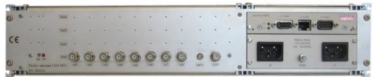
sat-nms LSM8 Rear Panel