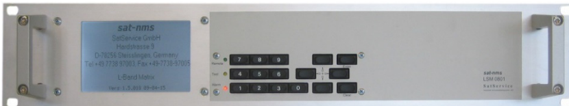
sat-nms LSM Front Panel with LCD Display and Keypad